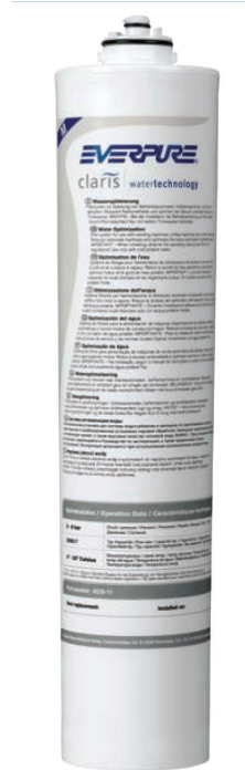
Claris Medium Filter Cartridge: EV4339-11

Everpure Claris water treatment systems (excluding replaceable elements) are covered by a limited warranty against defects in material and workmanship for a period of one year after date of purchase. Everpure replaceable elements (filter cartridges and water treatment cartridges) are covered by a limited warranty against defects in material and workmanship for a period of one year after date of purchase. See printed warranty for details. Everpure will provide a copy of the warranty upon request.